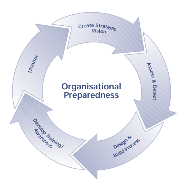
Figure 4: Promoting Organisational Preparedness is a Continuous Process

the risks of cyber misbehaviour can also become a strategic advantage in a world increasingly dependent on the security and reliability of communications networks.