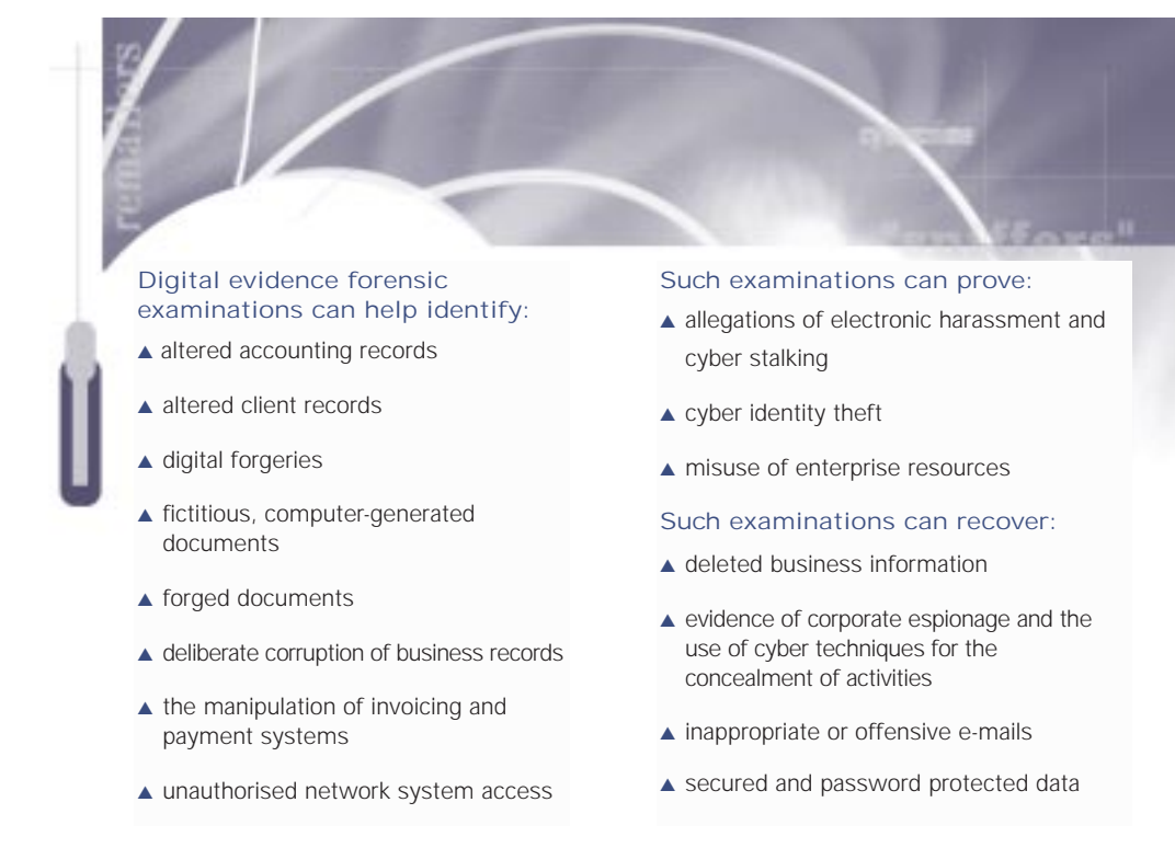
Figure 3: Digital Forensics—The Recovery of Evidence